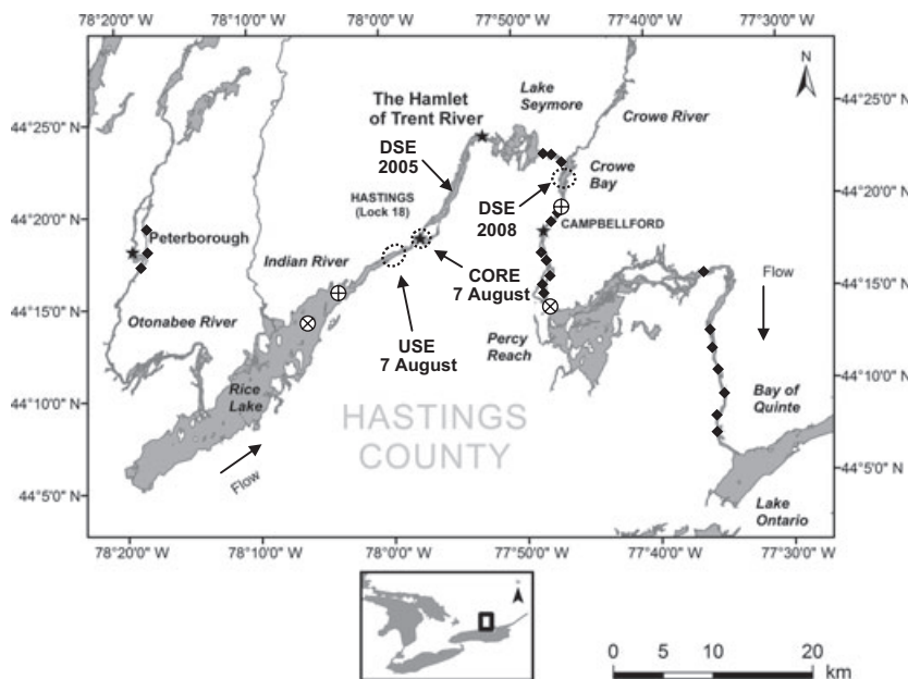
Figure 1. The Trent River between Rice Lake and the Bay of Quinte, Lake Ontario, Ontario, Canada. Sampling locations with sampling year(s) are indicated by arrows and dashed ellipses. Samples were collected from the area of first introduction (CORE), the upstream edge (USE), and the downstream edge (DSE). The downstream edge in 2005 is also indicated. The general location of round goby isolated from the main population body are denoted by ⊕ for those identified in 2007 and by ⊗ for those identified in 2008. Stars represent a human settlement, diamonds represent the approximate location of locks (except Lock 18 which is located in Hastings), and the inset map shows the location of the study area relative to the Laurentian Great Lakes.

and downstream of the area where it was originally introduced (Gutowsky & Fox 2011). Potential obstacles to range expansion include Healey Falls and Locks 14–18.